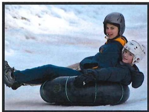
The 1st of September sees the arrival of Spring. Students have been making the most of the last of the winter activities and sports over recent weeks.