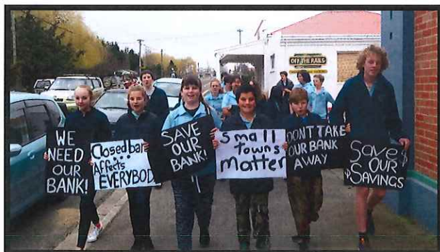
Students joined the protest march and wrote submissions to save our bank.